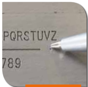
Metal deep engraving