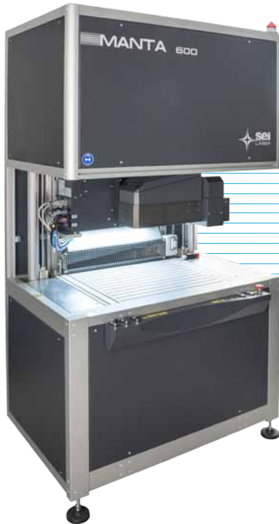
MANTA 600 T (sliding table option)