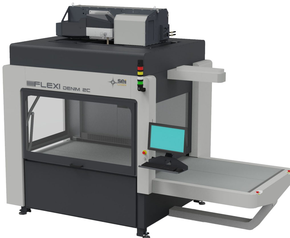
Custom laser preview